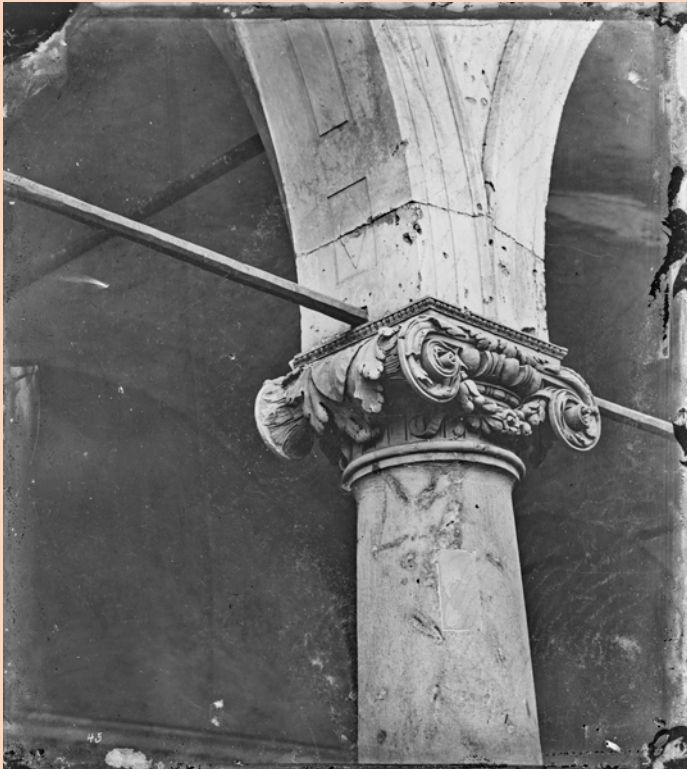
Josef Schulz, Column capital, the Belvedere in the Royal Garden of Prague Castle, 1865 collodion negative, digitally inverted, verso, 160 × 145 mm, IAH CAS